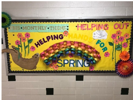
HELPING HANDS ACROSS OUR HALLS –

Question: Ask your children how they can help others and themselves.