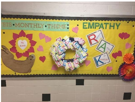
RANDOM ACTS OF KINDNESS wreath – these compliment cards are being given out in our building this month.

Question: Ask your children if they have the ability to understand the feelings of others?