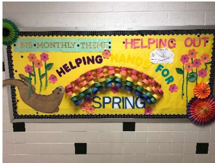
HELPING HANDS ACROSS OUR HALLS –

Question: Ask your children how they can help others and themselves.